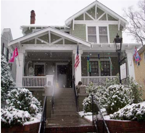
Photo of The Gaslight Inn taken January 19, 2008