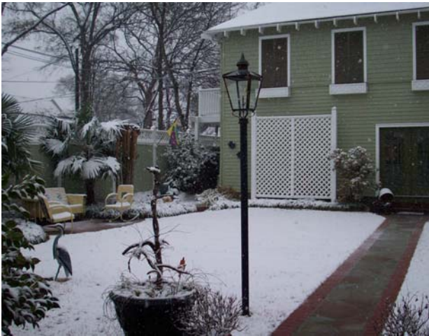
Photo of The Gaslight Inn courtyard taken January 19, 2008.